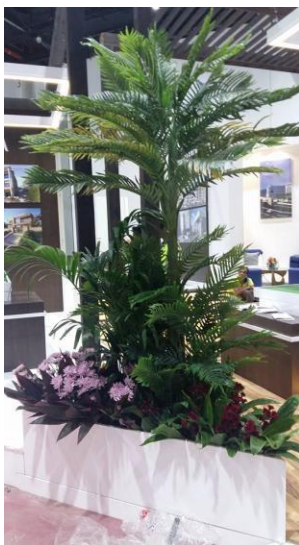
#12 Artificial Palm Tree 2-2.5m