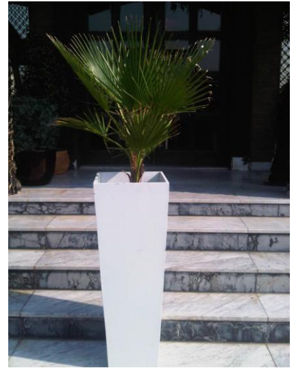
#12 Tall Plinth with Fan Palm