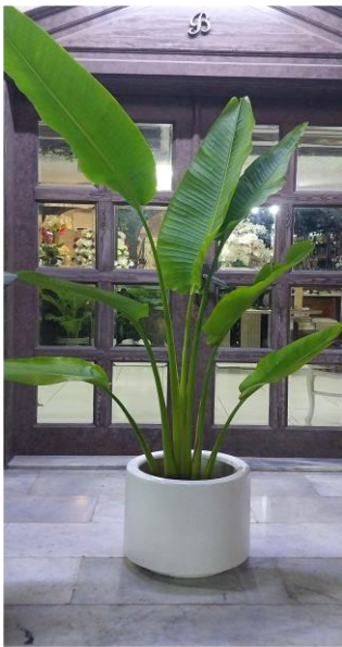
#13 Tall Plinth w/ Round Hedges