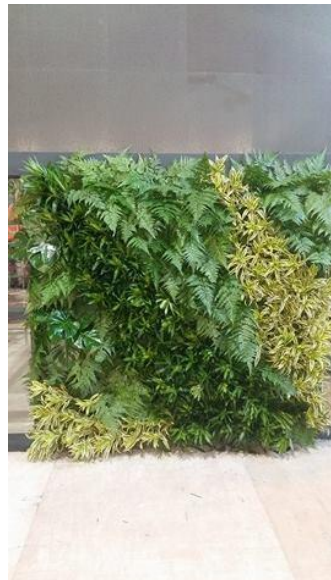
#16 Fresh Cut Leaves/ Moss Wall