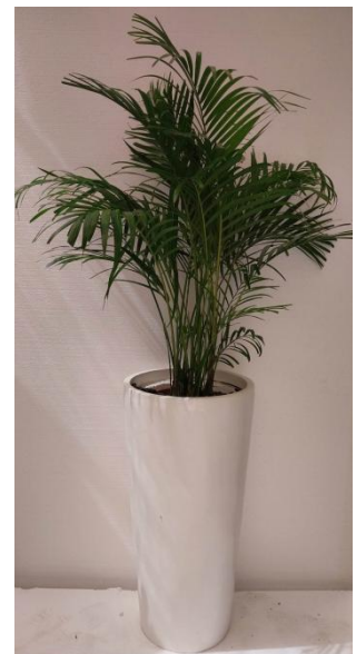
#15 Tall Plinth w/ Areca Palm