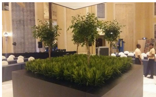
#8 Mixed Cut Leaves Arrangement