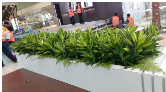
#2 Fresh Cut Leaves Arrangement