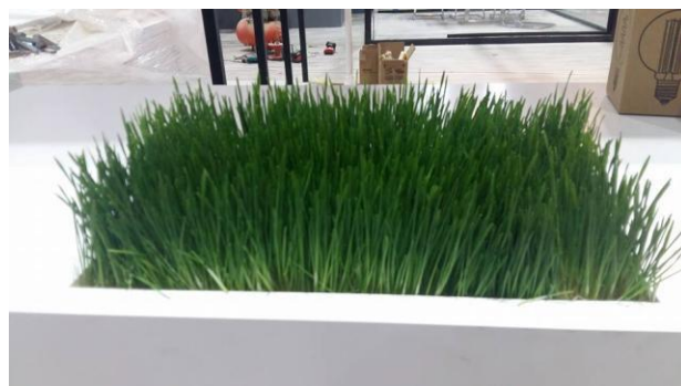
#6 Fresh Wheat Grass Arrangements