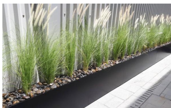
#4 Fresh Grass Arrangement (outdoor)