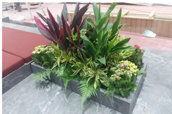
#7 Mixed Cut Leaves Arrangement