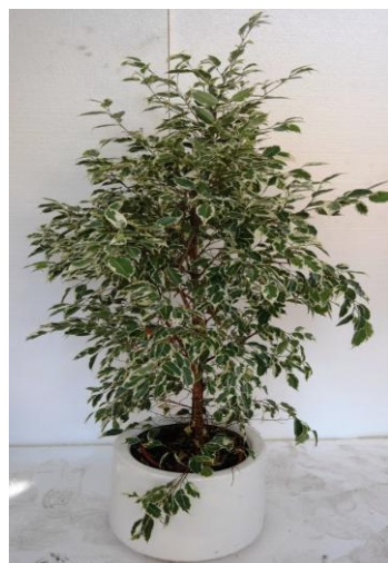
#4 STARLIT SERENADE