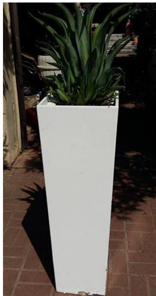
#14 Tall Plinth w/ Agave