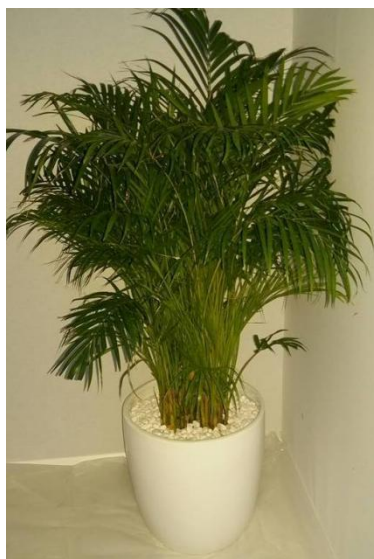
#2 ARECA PALM