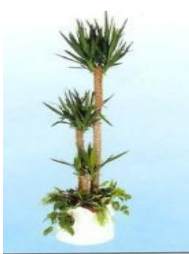
#8 POINT TO THE SKY