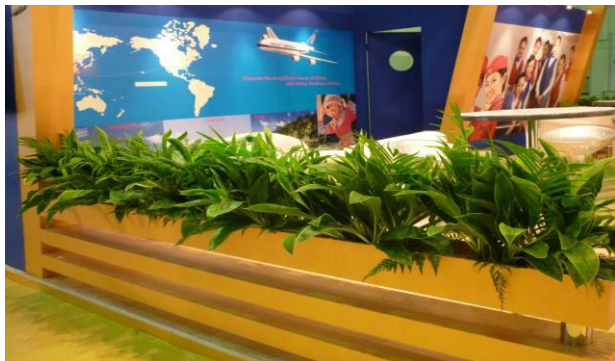
#1 Fresh Cut Leaves Arrangement