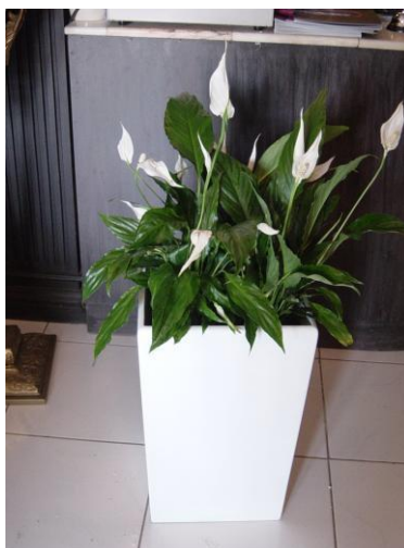
#17 Medium Plinth w/ Spathipylum