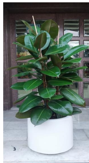
#3 FICUS ROBUSTA