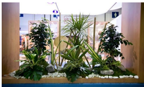
#3 Mixed Fresh plants and cut leaves arrangement