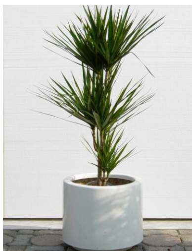
#5 DRAGON CLAW