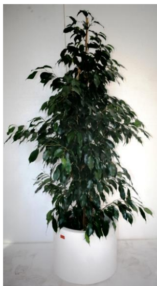
#1 FICUS BENJAMINA