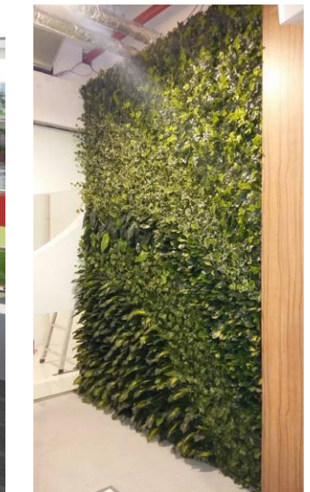
#14 Artificial Green Wall