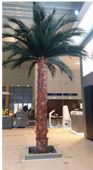
#13 Artificial Palm Tree 3m-5m