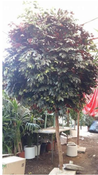
#11 Artificial Tree 2.5m – 4.5m