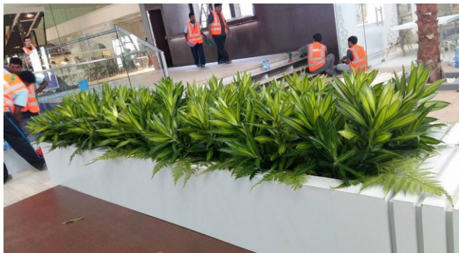
#2 Fresh Cut Leaves Arrangement