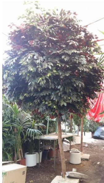
#11 Artificial Tree 2.5m - 4.5m