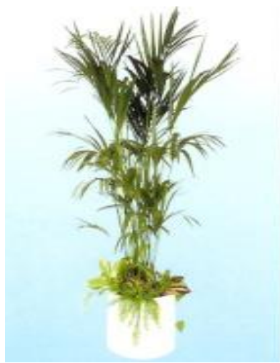
#3 KENTIA / PARADISE FOUND