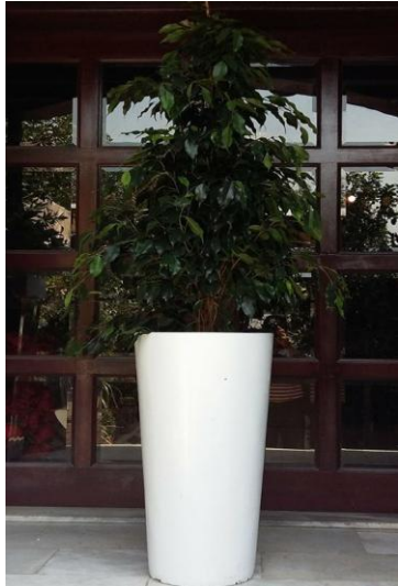
#11 Tall Plinths with Tall Ficus