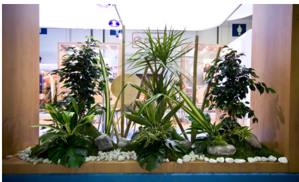
#3 Mixed Fresh plants and cut leaves arrangement