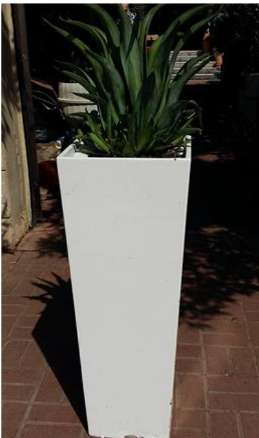
#14 Tall Plinth w/ Agave