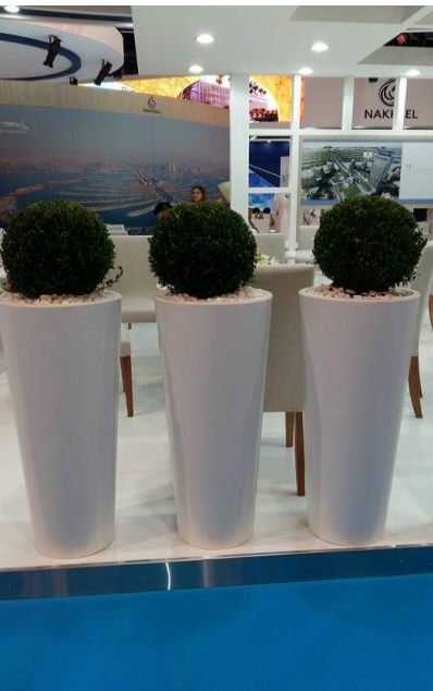
#13 Tall Plinth w/ Round Hedges