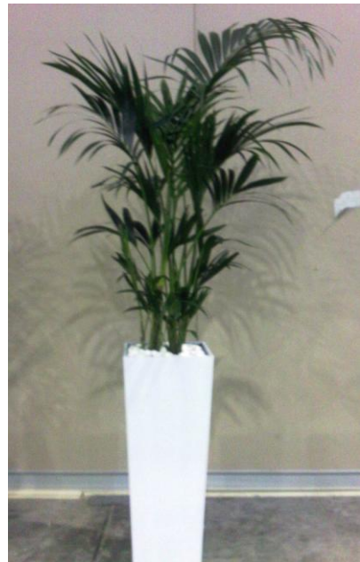
#15 Tall Plinth w/ Kentia Palm