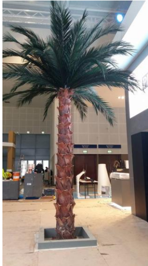
#13 Artificial Palm Tree 3m-5m