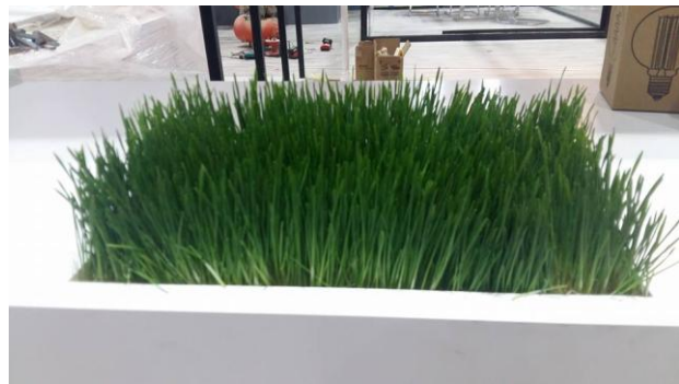
#6 Fresh Wheat Grass Arrangements