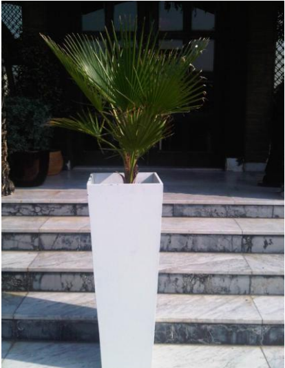
#12 Tall Plinth with Fan Palm