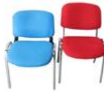
C1 - Upholstered Chair (Blue / Red)