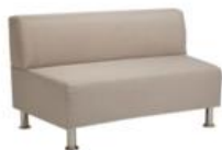
Archy Grey 2 Seater Sofa