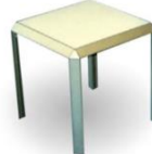
D5 – Coffee Table (L=50, W=50, H=45cm)