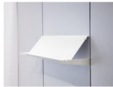
G2-S – SYMA Slope Shelf (H 0.5 x W 30 x L 97 cm)