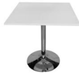
D2a – Square Table Chrome (L=70, W=70, H=87cm)