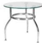
Melody Coffee Table (D=80cm, H=74cm)