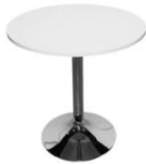
D1 – Round Table Chrome (D=80, H=80cm)