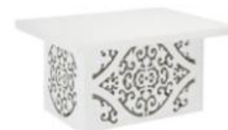
Mashrabiya Coffee Table (Rectangle) (L=80cm, W=60cm, H=45cm)