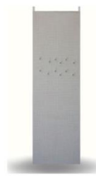
H6a – Small Pegboard (90 x 240 cm – 12 Hooks)