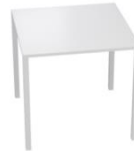
D2b – Square Table White (L=80, W=80, H=72cm)