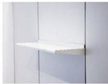
G1-S – SYMA Flat Shelf (H 0.5 x W 30 x L 97 cm)