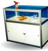
E3 - Octanorm Showcase (100 x 50 x 90 cm)