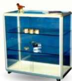
E1 - Low Showcase (100 x 50 x 100 cm)