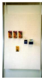
H5 – Small Pegboard (90 x 120 cm – 6 Hooks)