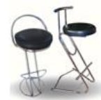
B1 - High Chrome Stool