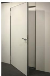
H1-S – SYMA Lockable Door (H 250 x W 6 x L 97 cm)