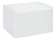
Alpha Coffee Table - Regular (L=70cm, W=51cm, H=41cm)