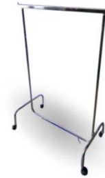
H2 – Garment Hanger