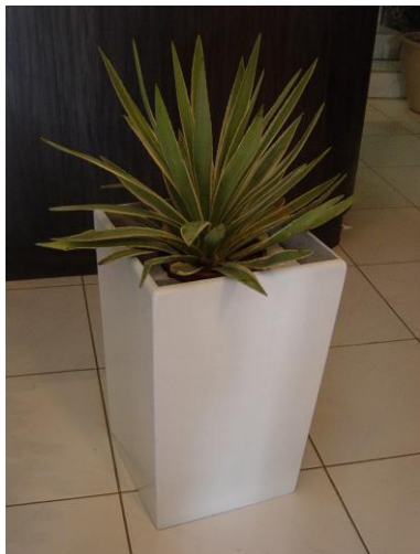
#16 Medium Plinth w/ Silver Aloe