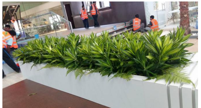
#2 Fresh Cut Leaves Arrangement