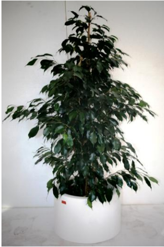
#1 EXOTICA FICUS