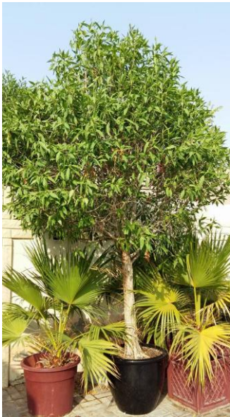
#9 Damas Tree 3m