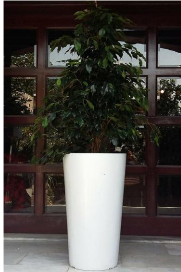
#11 Tall Plinths with Tall Ficus