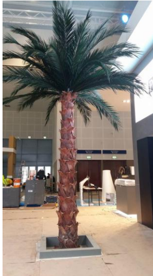
#13 Artificial Palm Tree 3m-5m