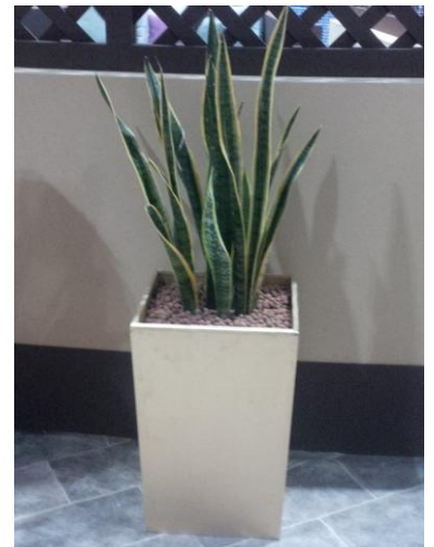
#18 Medium Plinth w/ Sanseveria