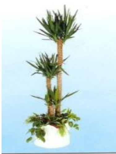
#8 POINT TO THE SKY