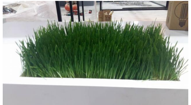
#6 Fresh Wheat Grass Arrangements