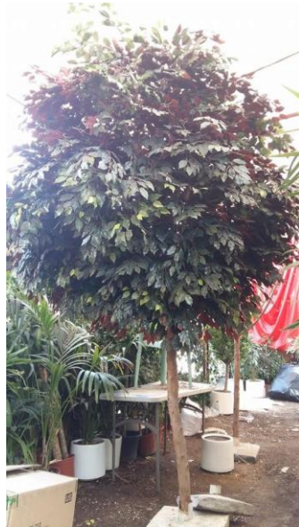
#11 Artificial Tree 2.5m – 4.5m