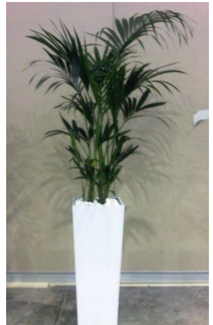
#15 Tall Plinth w/ Kentia Palm