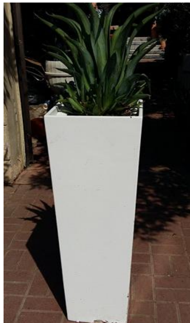
#14 Tall Plinth w/ Agave