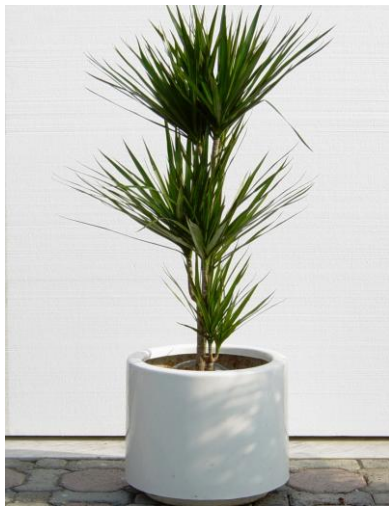
#5 DRAGON CLAW