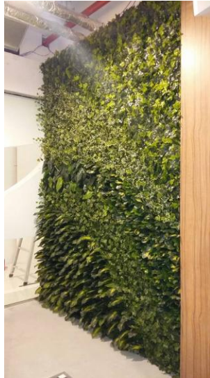
#14 Artificial Green Wall