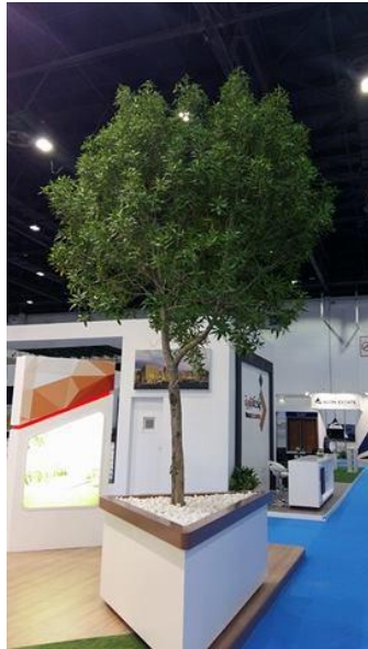
#10 Damas Tree 4m