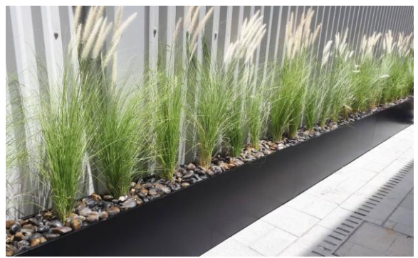
#4 Fresh Grass Arrangement (outdoor)