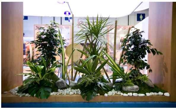
#3 Mixed Fresh plants and cut leaves arrangement