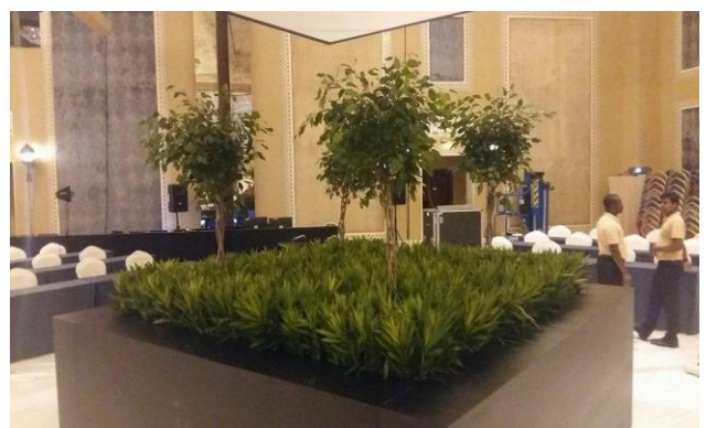
#8 Mixed Cut Leaves Arrangement