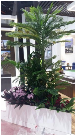
#12 Artificial Palm Tree 2-2.5m