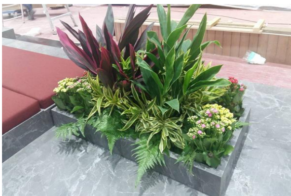
#7 Mixed Cut Leaves Arrangement