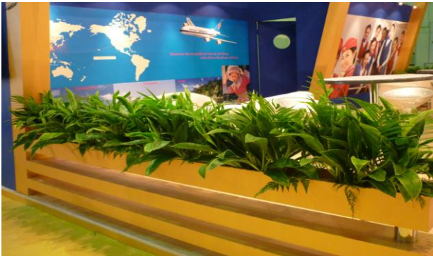
#1 Fresh Cut Leaves Arrangement