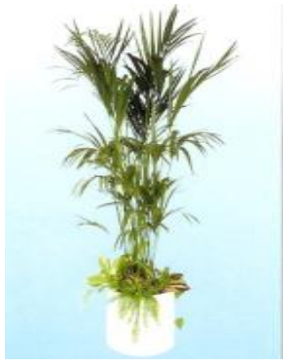
#3 KENTIA / PARADISE FOUND