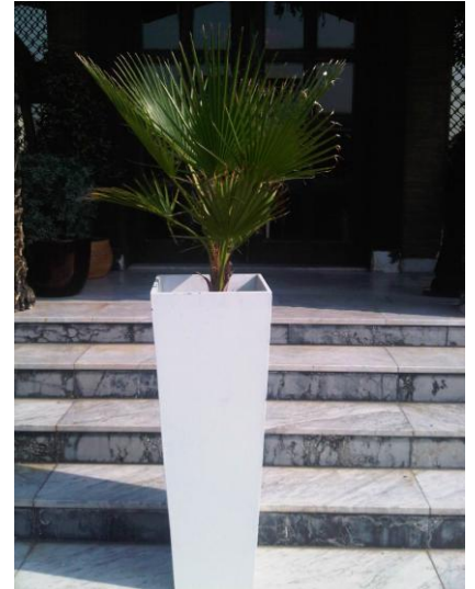
#12 Tall Plinth with Fan Palm