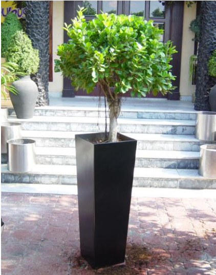
#10 Tall Plinth w/ Round Ficus