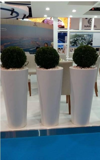
#13 Tall Plinth w/ Round Hedges