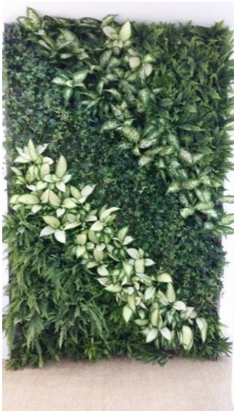
#15 Fresh Plant Vertical Garden