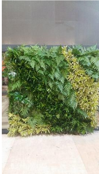
#16 Fresh Cut Leaves/ Moss Wall