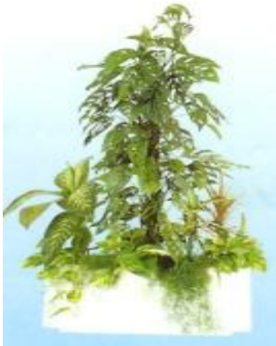
#7 MASTER MIXED