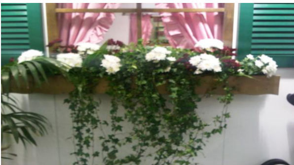
#5 Mixed Fresh Flower and Cut Leaves Arrangement